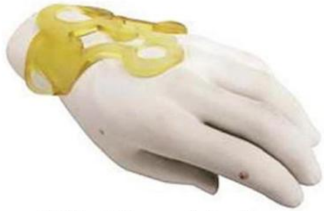
■ This wrist brace was designed by using a 3-D scanner and 3-D printer.

Stone has also launched a project called Ana that lets student create 3-D shapes based on an alphanumeric code he designed. It is a way of “speeding up the process of acceptance” so that students from various disciplines can experiment with and learn more about the technology.